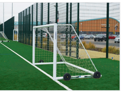
S&C Slatter Case Study Hart Leisure Centre